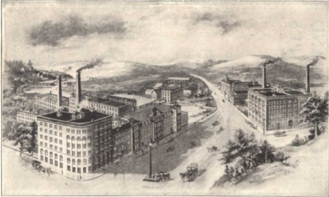
BIRD'S-EYE VIEW OF WALTER BAKER & CO.'S MILLS, DORCHESTER AND MILTON, MASS. FLOOR SPACE, 350,000 SQUARE FEET.