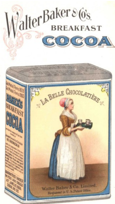
FAC-SIMILE OF 1/2 LB. CAN.

BAKER'S BREAKFAST COCOA In 1-5 lb., 1-4 lb., 1-2 lb., 1 lb. and 5 lb. tins